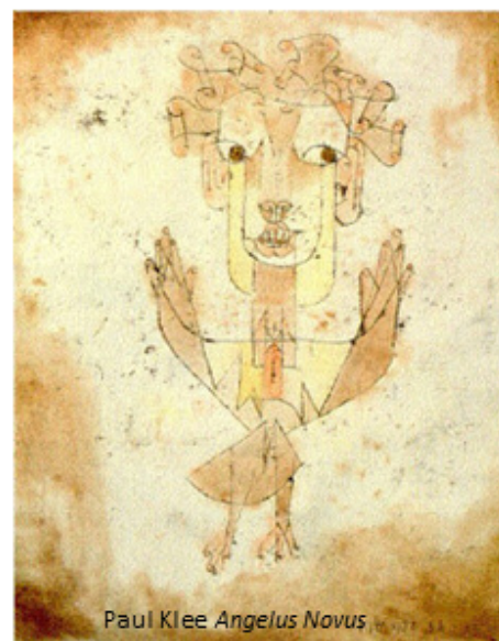
Paul Klee Angelus Novus

Social “development” often only deepens structural processes that perpetuate injustice, exploitation, and racism. American slavery provided cause for a racist ideology that may have clouded people’s vision, but it could not conceal the violence and exploitation at its core. In the early days of industrial production, the direct social relations between workers and owners enabled the worker to see the contribution of their own poverty to both the property and the pockets of the owner. Today, racial inequality continues with great effect in a “color-blind” system “without racists.” Today, poverty often appears to be more about neglect, than active exploitation. Few can trace their dispossession to the accumulations of others, while those who accumulate insulate themselves from those who bear the cost of their good fortune.