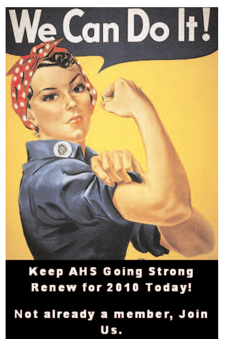
Please fill out the membership blank inserted in this newsletter.