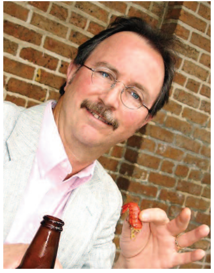
(continued on page 4)

There are a number of bars that serve food—most commonly the local sandwich, the "po' boy," that would be referred to as a grinder or sub sandwich in other parts. I prefer mine with fried oysters and "dressed" (lettuce, tomato, etc.), but some like shrimp, a combo, or you can get a variety of things on them depending on the place. One of the best po' boys I had was at a trashy-looking place that we think is named The Corporation,